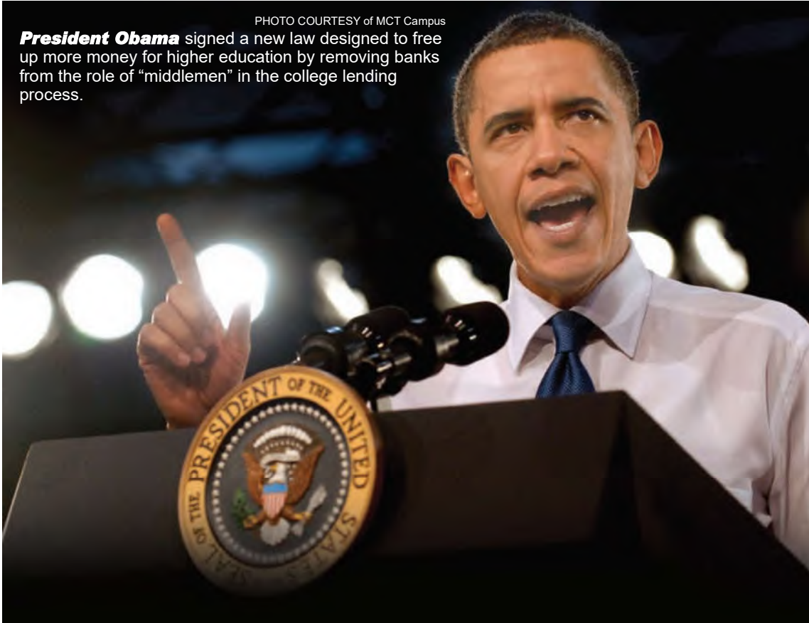
PHOTO COURTESY of MCT Campus President Obama signed a new law designed to free up more money for higher education by removing banks from the role of "middlemen" in the college lending process.