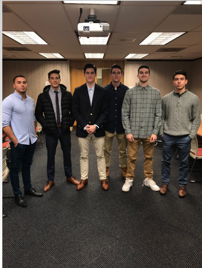
2019 Executive Council