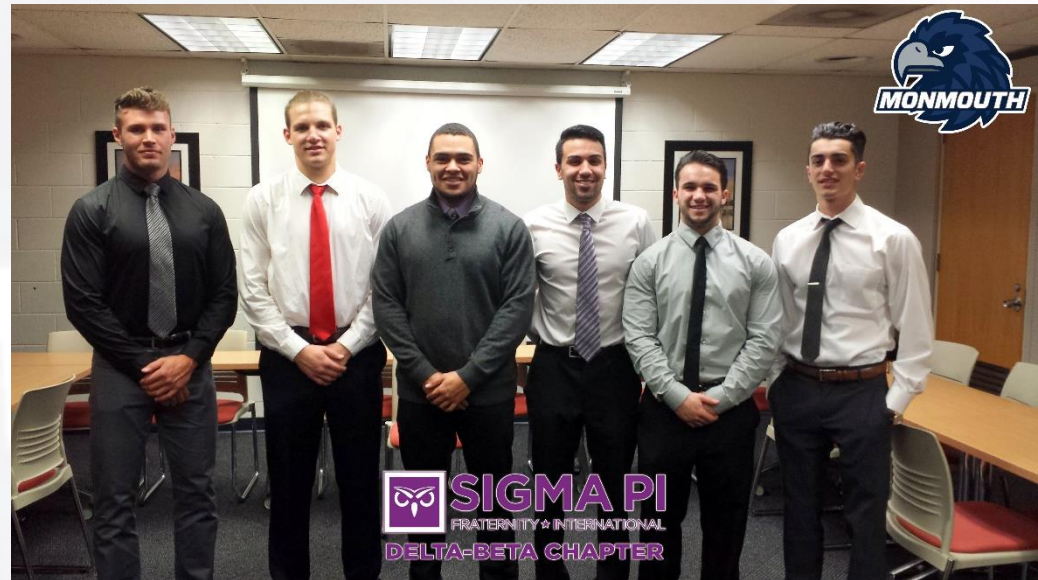
2016 Executive Council