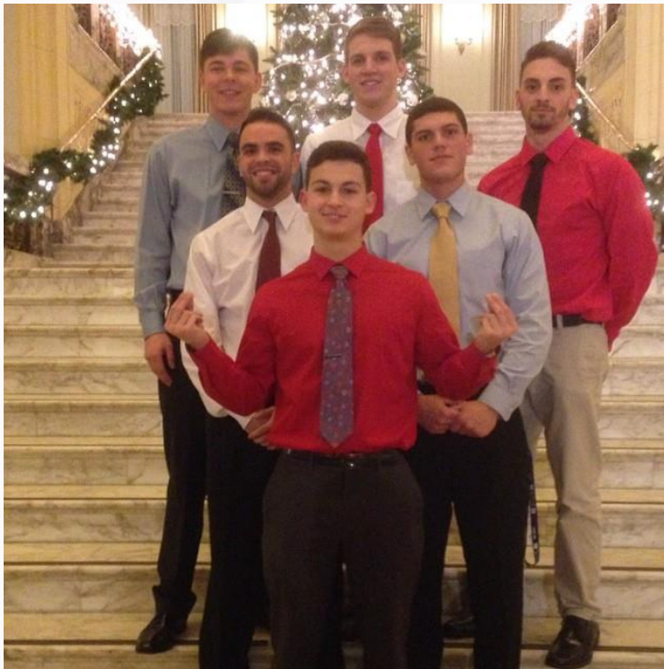
2015 Executive Council

The Delta-Beta Chapter thanks the 2015 Executive Council for their hard work and dedication throughout the year. We are excited to the direction that the 2016 Executive Council moves Delta-Beta in this year!